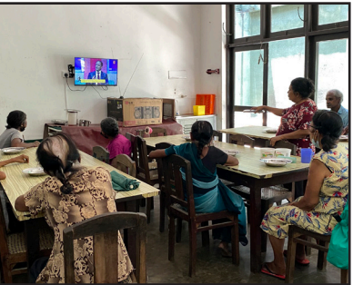
The Helping Hands community enjoying their new television set