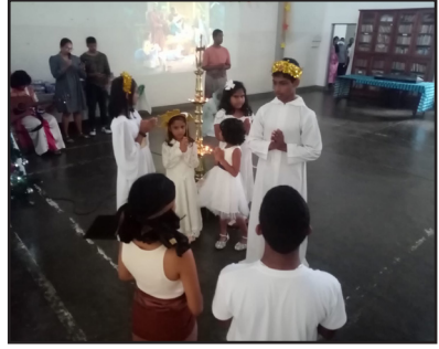
Youth Christmas Party