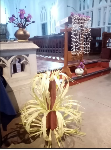
Church Decorated to Host the Service of Induction of the NCC President