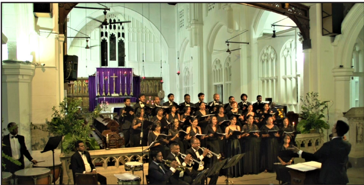
Colombo Philharmonic Choir's performance of Karl Jenkin's 'The Armed Man'