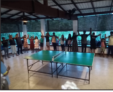
Sunday School Field Trip