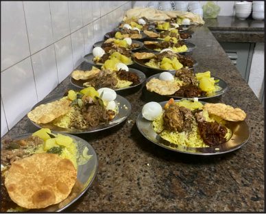
Helping hands meals