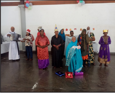
Helping Hands Christmas Party