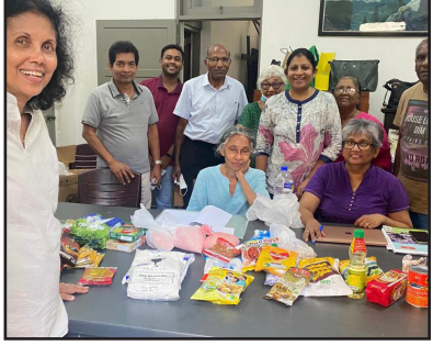
The Help in Need Community