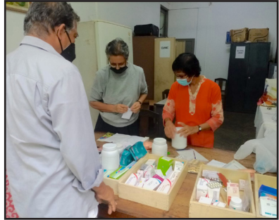
The Medical Clinic